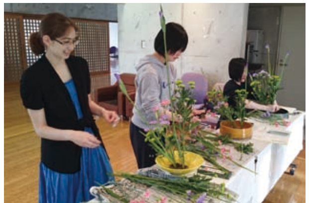
Flower Arrangement Club Activity