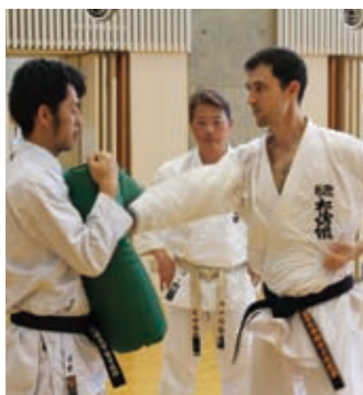
Karate Club Activity