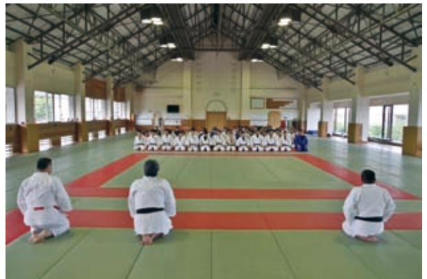
Judo Club Activity

The university is located in Katsuura City, Chiba Prefecture, in Japan. Facing the Pacific Ocean, the campus is backed by the mountains of the lower Boso Peninsula. The capital city Tokyo is only one and a half hours away by a limited express train departing hourly from Katsuura station. Katsuura's climate is generally mild; however, it does enjoy four distinct seasons. One can expect plenty of rain in Spring and Fall, Summers can be hot and humid with temperatures up to the mid-30's(°C), and the Winter may have a few days of snow. The population of Katsuura is approximately 20,000; however, being a resort town the summer season is invariably crowded with many tourists.