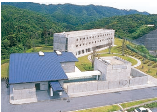
Matsumae Memorial International Exchange Hall