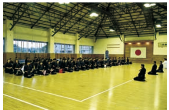
Kendo Club Activity