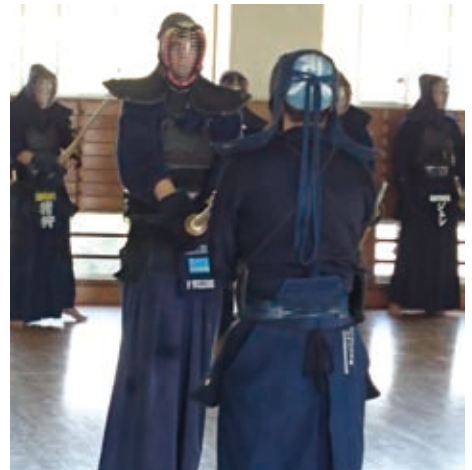
Kendo Club Activity

Students who have successfully completed a minimum of 26 units, including all required classes, maintained appropriate conduct throughout their residence, and satisfied all accounts with the university will be awarded the Certificate of Completion.