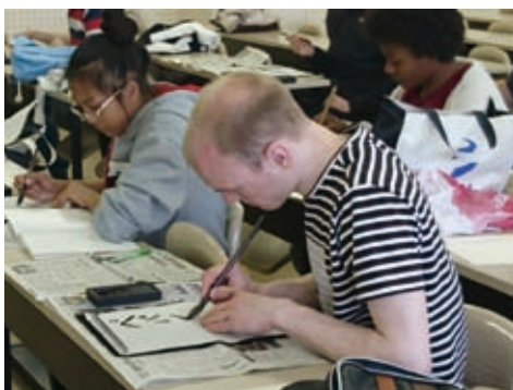
Calligraphy Club Activity